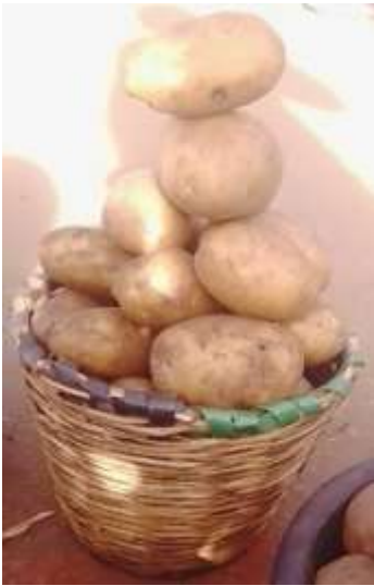
Basket of potatoes at Fort Portal Mpanga market

and these are the most demanded quantity since they are cheaper and in small quantity for an average consumer to buy.